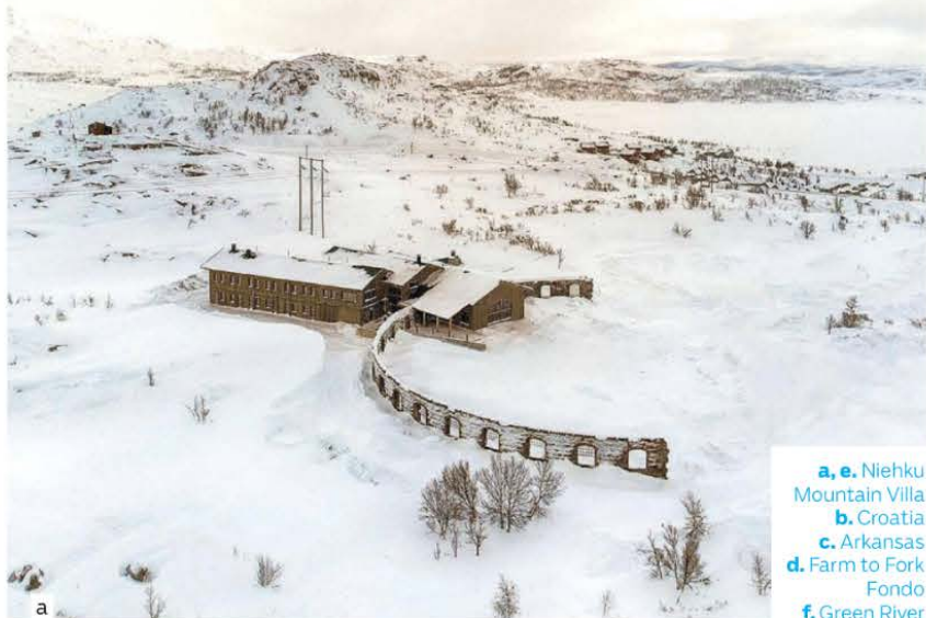
a, e. Niehku Mountain Villa b. Croatia c. Arkansas d. Farm to Fork Fondo f. Green River