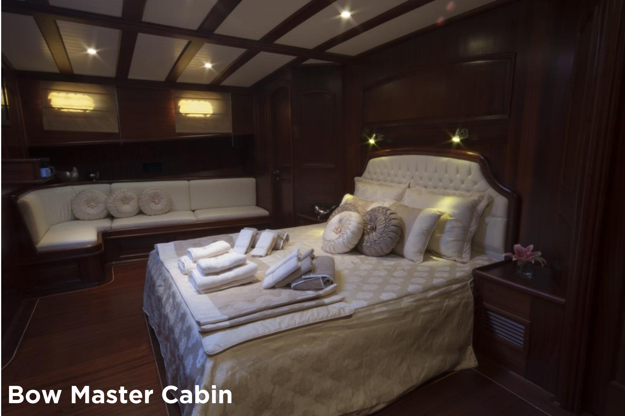
Bow Master Cabin