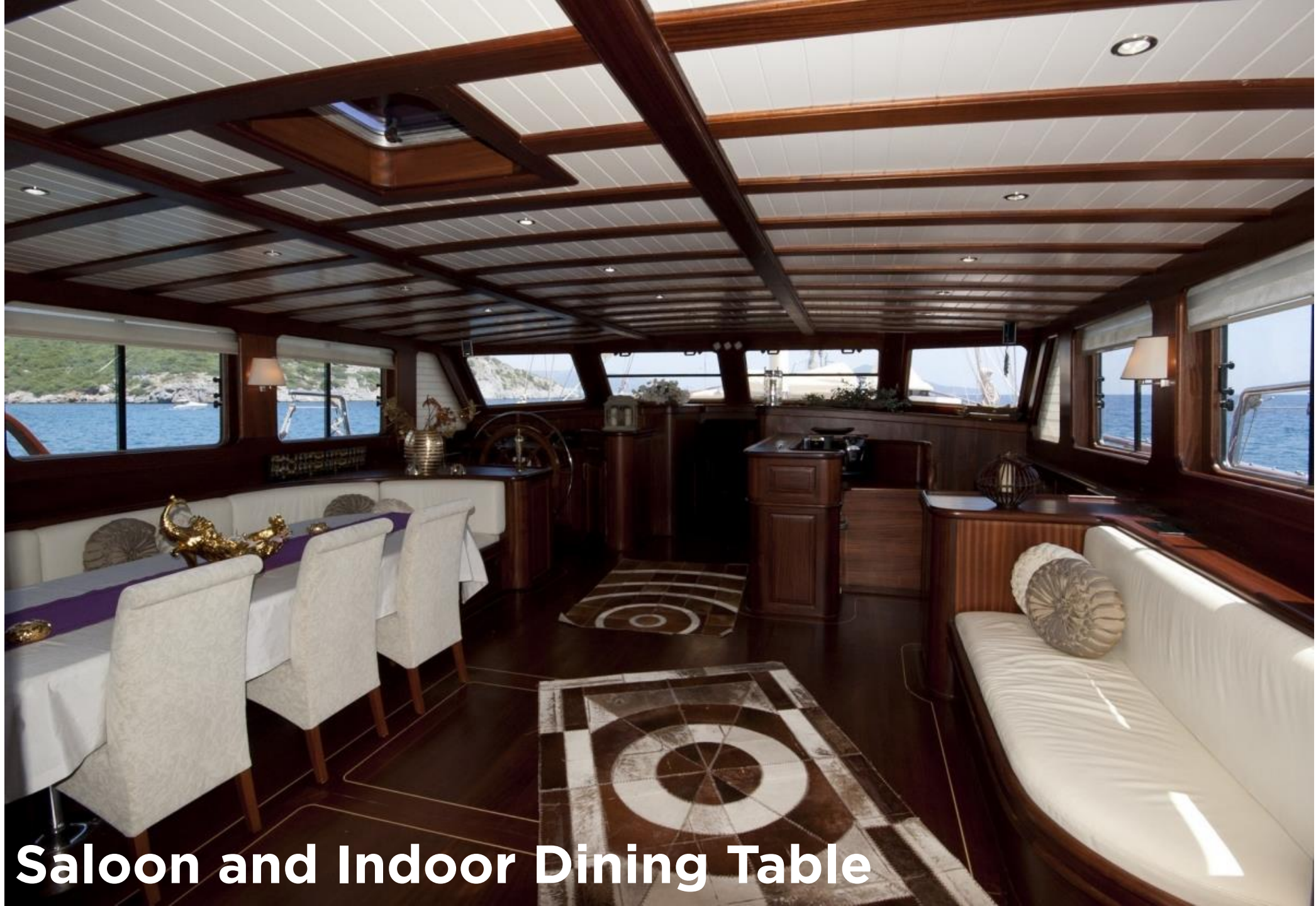
Saloon and Indoor Dining Table