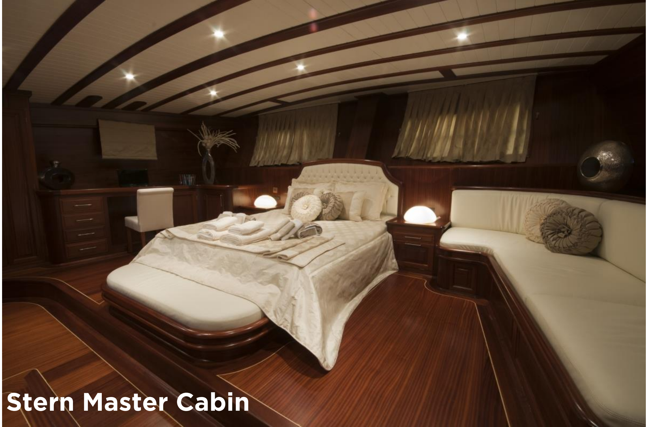
Stern Master Cabin