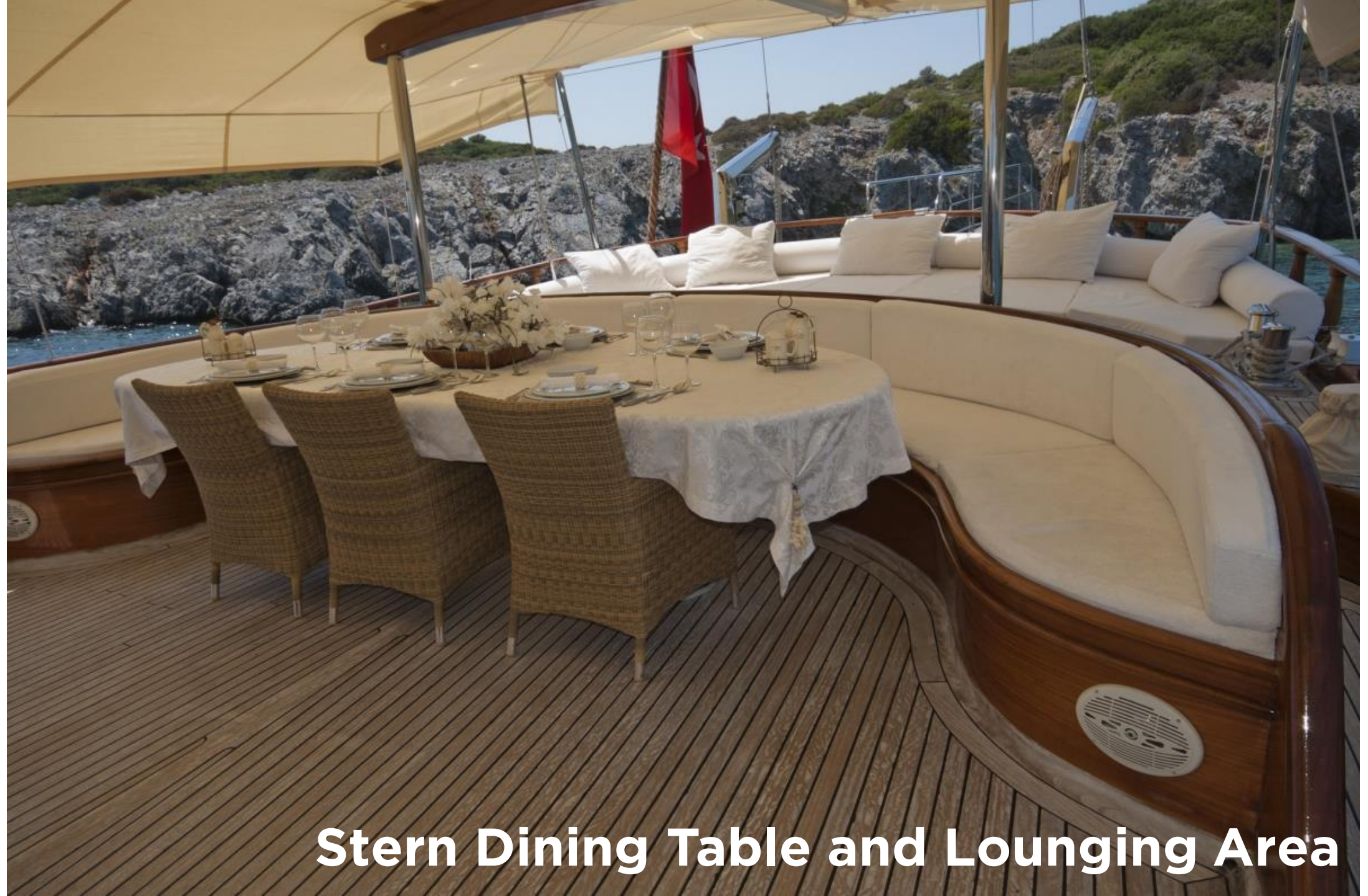
Stern Dining Table and Lounging Area