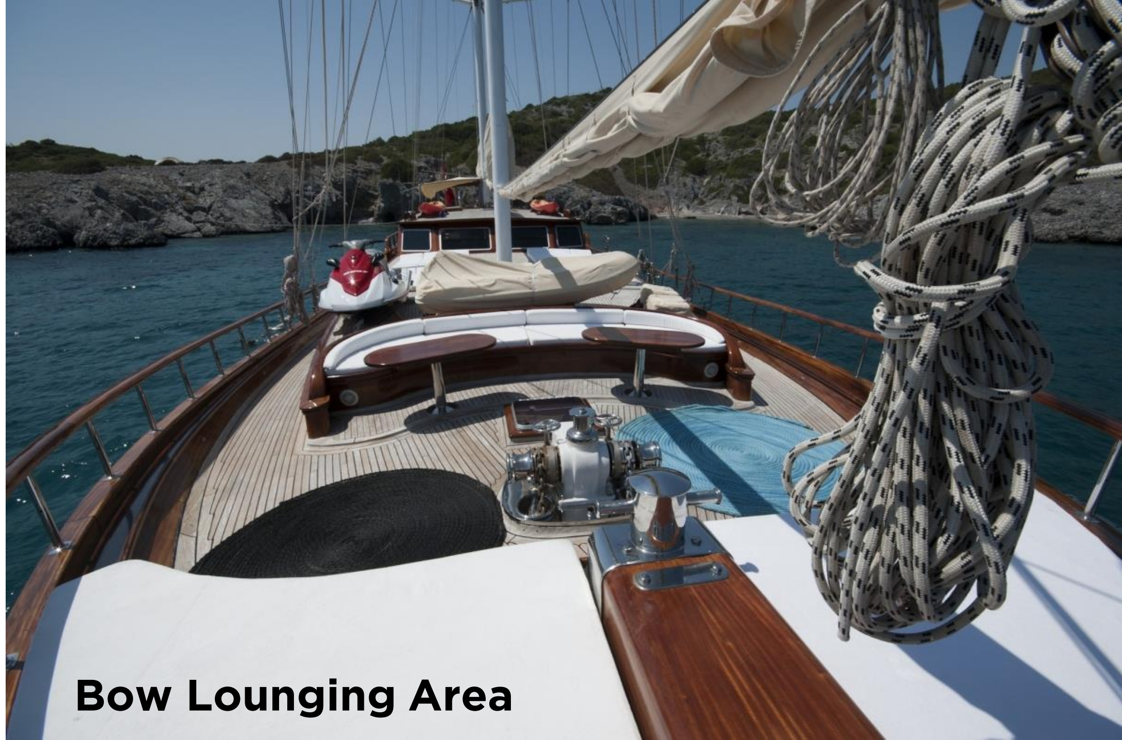
Bow Lounging Area