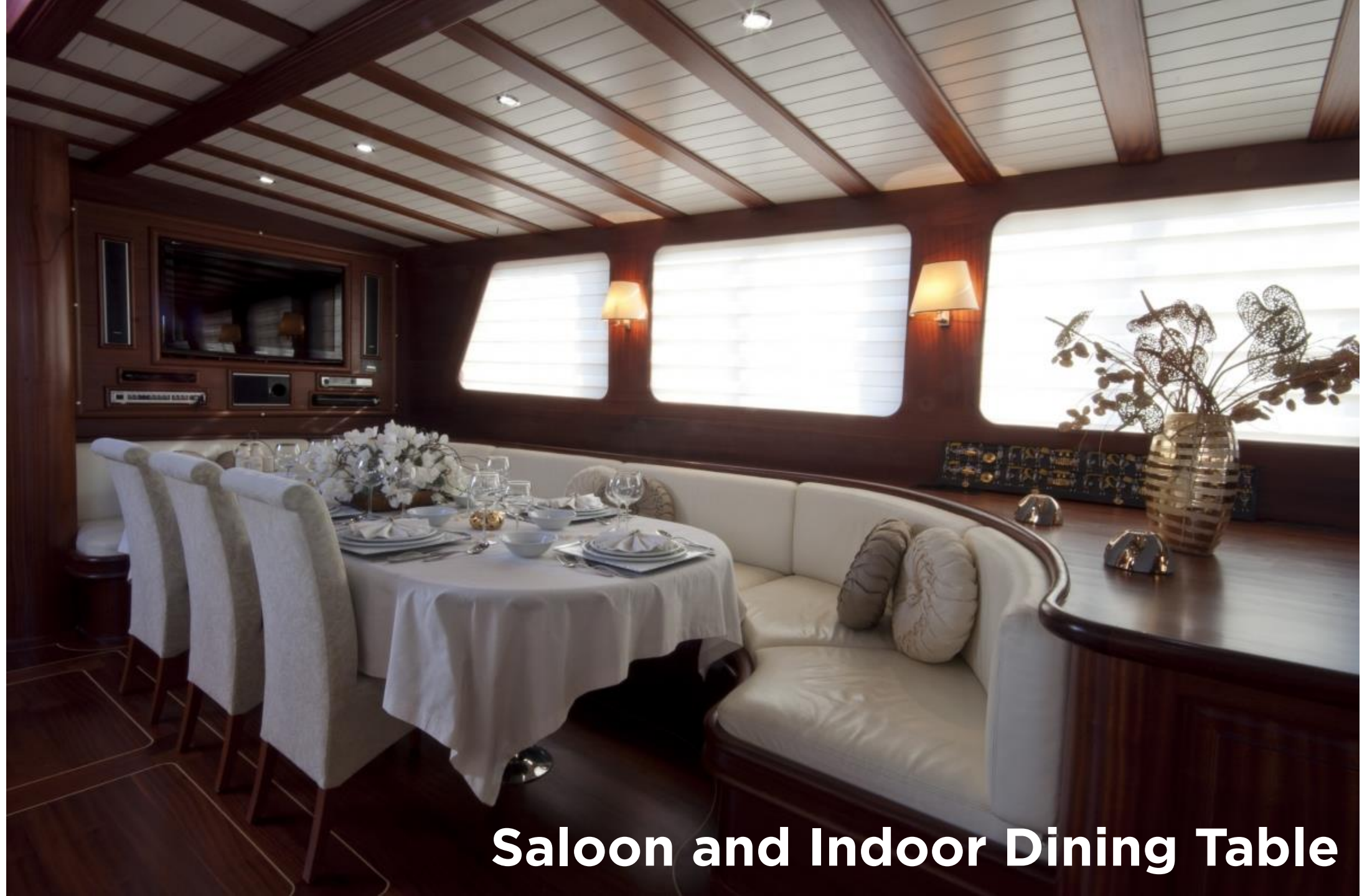
Saloon and Indoor Dining Table